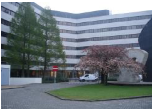
Offices Initiative Group

If you prefer to take a taxi please note that it will take 30 tot 45 minutes depending on the traffic/rush hour. The costs will be € 50,00 to € 60,00 per ride.